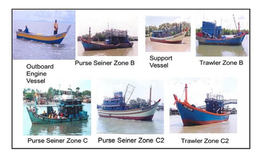
Figure 2: Types of fishing vessels in Malaysia and Sarawak.